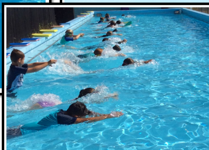
Piopio Primary School students giving it their all at the school's swimming sports held recently.