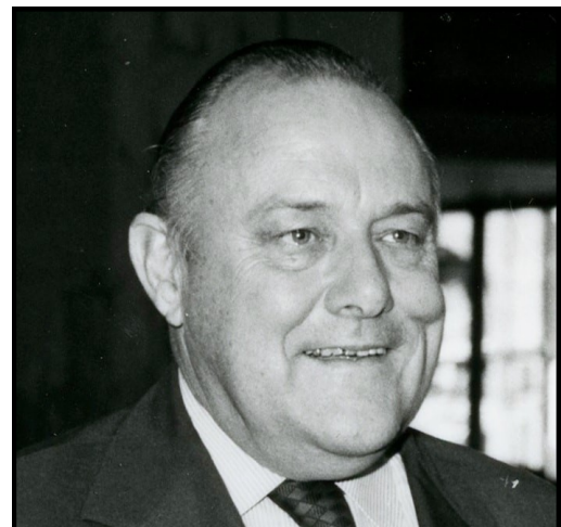
Babe Ruth achieves 139 home runs and Robert Muldoon was born