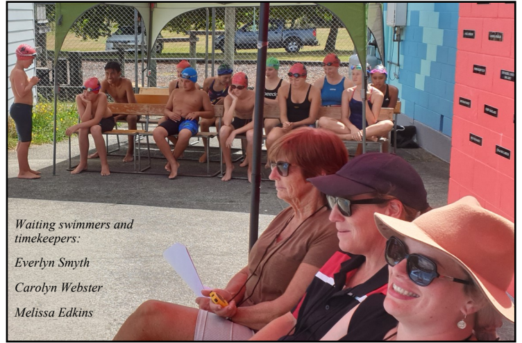
Waiting swimmers and timekeepers:

Many thanks to our committee, parent helpers, timekeepers and coaches whom helped officiate on the day. Continued thanks to the Piopio Pool Trust for the use of their facilities for the season.