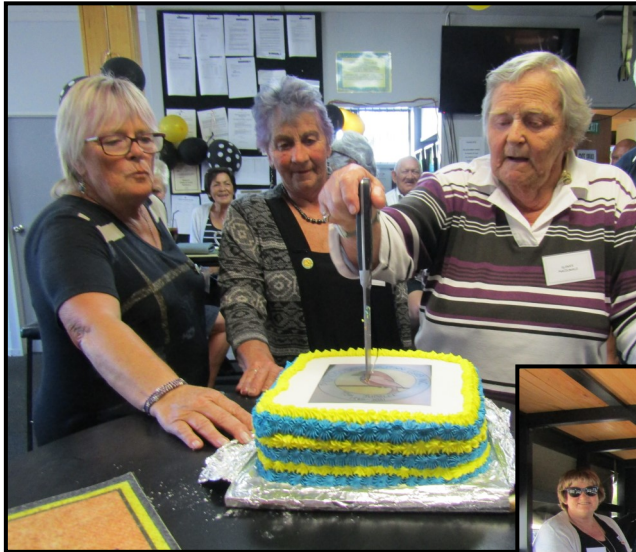
Left—Piopio College Kapa Haka Students